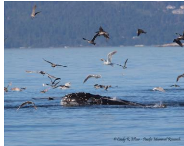
Lunge feeding humpback whale