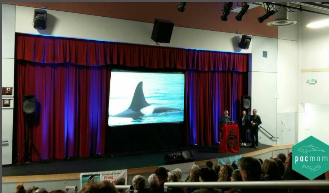
Just one of the fascinating presentations at the 2018 "Ways of Whales" workshop.

This event is a wonderful opportunity to learn more about our local whales and the many factors that affect them, as well as a great chance to bring researchers, educators, interested individuals and young people together. Thank you to Orca Network for another great day - you can watch a full video archive of the day here .