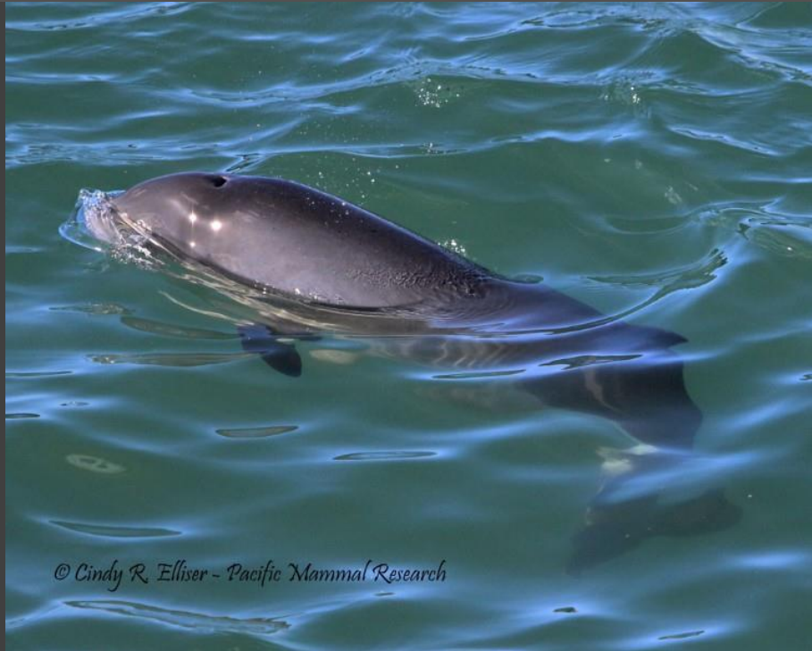
Harbor porpoise coming up for air on a beautiful clear day in Burrows Pass.

Well what else has been going on in the last month? Keep reading to find out!