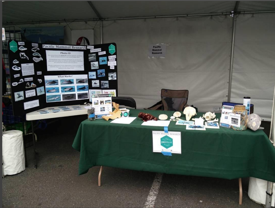
PacMam's booth at the 2017 Anacortes Waterfront Festival.