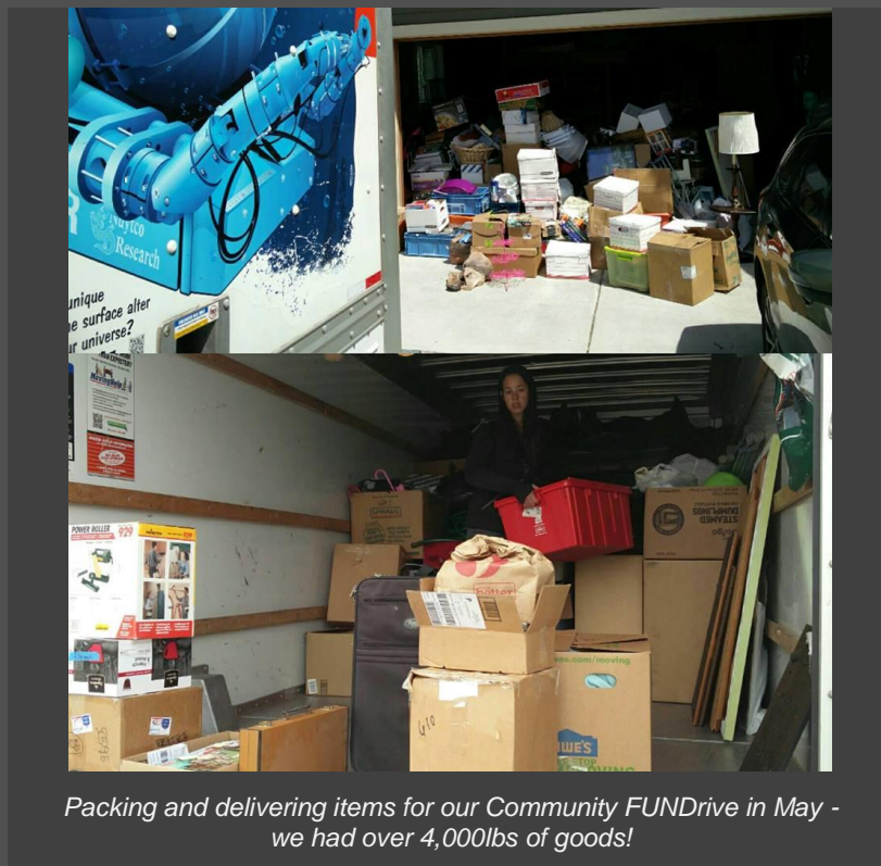
Packing and delivering items for our Community FUNDrive in May - we had over 4,000lbs of goods!